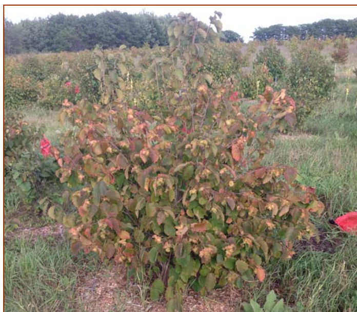
Photo 2. Our top eight selections such as this one (Cuddy 2-28 at age 6 in Bayfield) are precocious and compact with high yield densities.

Working under the hypothesis that individual genotypes capable of supporting a commercially viable hedgerow production system already exist in the hybrid and wild C. americana populations in the Upper Midwest we launched the Hazelnut Improvement Program in 2007 to find and evaluate these genotypes. First, we screened (and continue to screen) on-farm plantings of hybrid seedlings populated with material primarily from the Badgersett Research Corporation, Forest Agriculture Enterprises, and the Arbor Day programs (Fischbach et al., 2011). Then, in 2009 we began establishing replicated performance trials at five Midwestern locations (St. Paul, Lake City, and Lamberton, MN in 2009, and Bayfield and Tomahawk, WI in 2010) and populating them with clones of the highest-performing plants identified in the on-farm plantings. The clonal propagules have been generated through a combination of mound-layering and stem cuttings. We now have up to six bearing years of performance data from these trials and have identified select genotypes based on those data (Braun et al., in review). The top genotypes were selected on the basis of precocity, kernel sphericity and size, annual yield, yield density (lbs of kernel per square foot of canopy coverage), and susceptibility to eastern filbert blight. We anticipate providing clonal material of these genotypes to growers for limited trial starting in 2017.