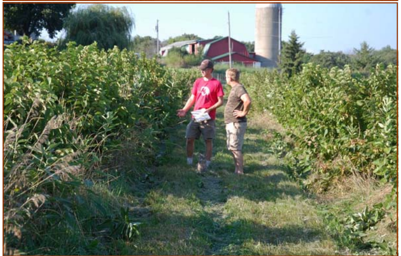
Photo 4. Work is underway to determine optimal plant density to maximize early yields. A 6' in-row plant spacing used in the performance trials leaves wasted space between plants at low fertility sites like Bayfield (top), but might be too close at high-fertility sites like Stoughton (bottom).

Research is underway to determine exactly how to optimize per acre yields of our hedgerow system with our select genotypes, and we are pursuing two strategies. First, we have selected genotypes with compact size by selecting for high precocity, annual bearing, and small plant size. With such compact genotypes we anticipate an initial in-row plant spacing of 4 feet and possibly less. Just how large the select genotypes will get remains to be seen and will depend on site fertility, but if competition is severe, every other or every third plant could be removed and a continuous hedgerow still maintained. Of our top genotypes, some have considerable rhizomatous suckering (Photo 3) with a spreading growth habit, while others have little to no suckering (Photo 3) with a compact growth habit. Thus, optimal planting density may vary depending on growth habit and we will be conducting plant density trials to determine the optimal spacing.