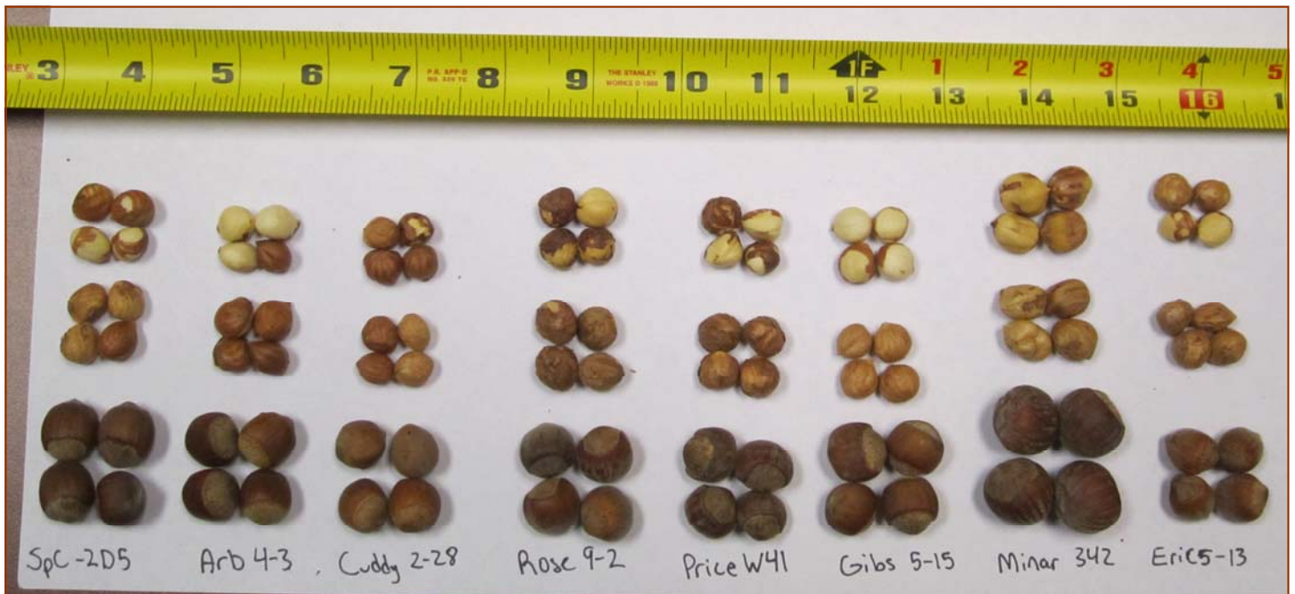
Figure 1. In-shell nuts (bottom), raw kernels (middle), and roasted kernels (top) from our top eight selections. Nuts shown are from the St. Paul planting.