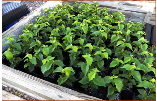
Photo 5. Clonal liners in a cold frame being acclimated prior to transplanting. The estimated cost for 1 year clonal liners in 4"x4"x6" pots is $3.10/plant.