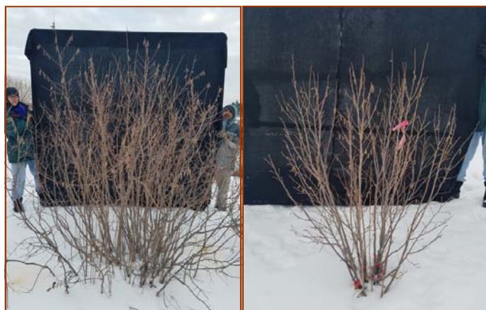
Photo 3. The growth habits of hazelnuts vary by genotype. Some have a spreading form from rhizomatous suckering (left) while others remain compact with little suckering (right).