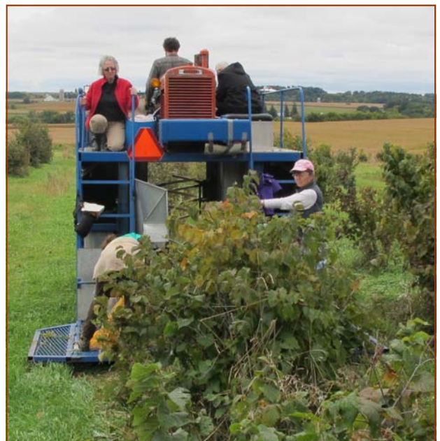
Photo 1. In-husk nut clusters are harvested directly from the hedgerows. Growers are currently using blueberry harvesters, but work is underway to develop more effective equipment.

Commercial hazelnut production in the U.S. is centered in the Willamette Valley of Oregon and is based on tree-form cultivars of C. avellana where large in-shell nuts fall free from the husk when ripe and are swept off the orchard floor. The system we envision for the Upper Midwest is modelled after bush-fruit systems with nut clusters mechanically harvested direct from hazelnut hedgerows (Photo 1). We envision a Midwest hazelnut industry based on high volume production of relatively small but high-quality uniform kernels for fresh and processing markets. Our focus has been to develop precocious, high-yielding, compact, multi-stem genotypes with the American hazelnut growth form (Photo 2). We are working to adapt blueberry and Aronia harvesting equipment